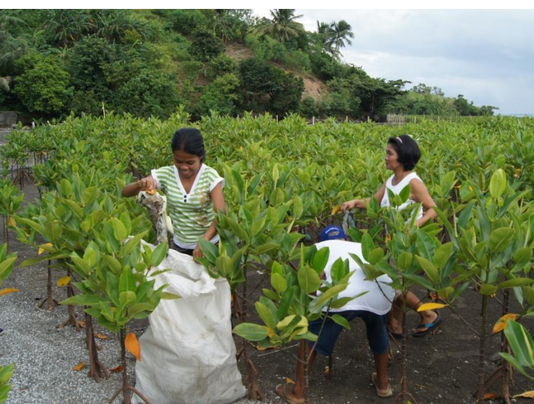
Left: mangrove seedlings; Right: five years later