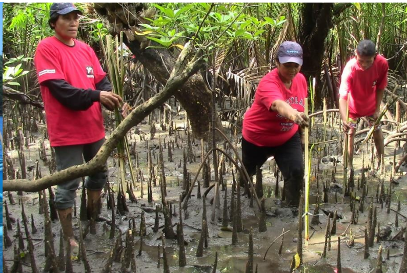
Left: Seaweed farmers plant seedlings in Calico island (Photo: Cordaid); Right: Mangrove replanting in Surigao del Norte (Photo: Netherlands Red Cross); Front Cover: Alternative livelihoods to address food insecurity (Photo: Cordaid)